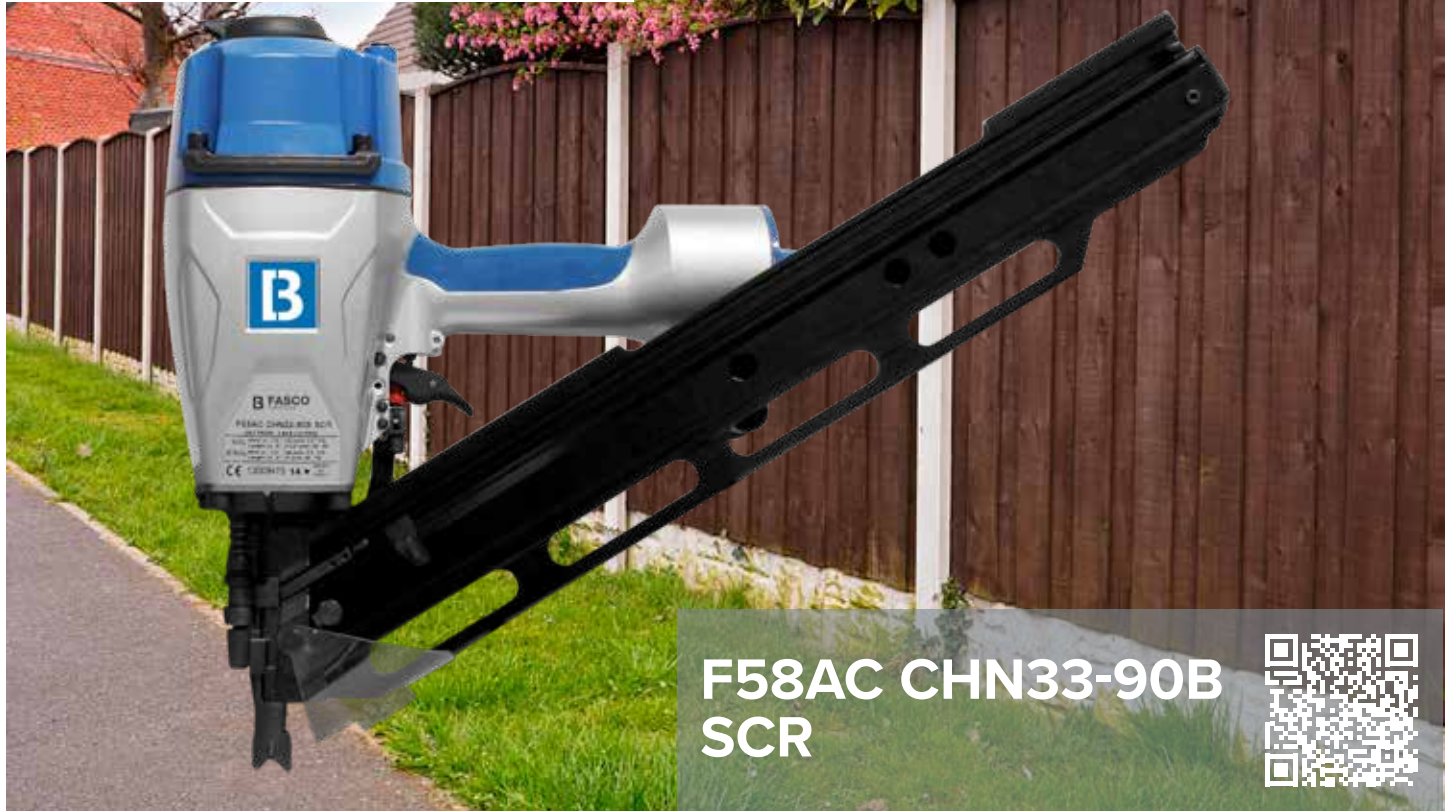
F58AC CHN33-90B SCR