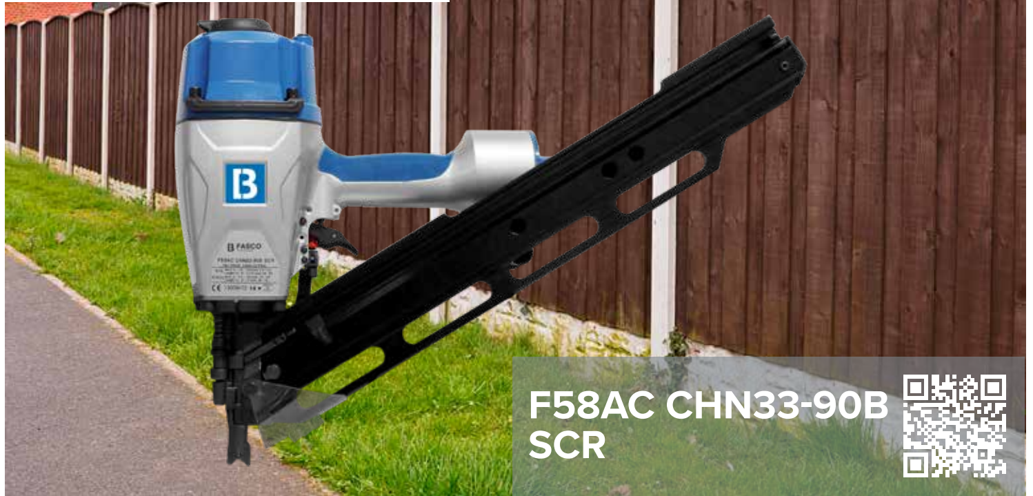
F58AC CHN33-90B SCR